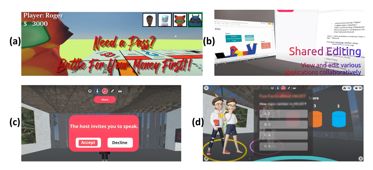
Figure 2: (a) BoardgameVR proposed by Group 1 – battles with each other in certain positions. b) Collaborative word processing in social VR environment proposed by Group 3. (c & d) Augmented features of desktop social VR proposed by Group 2 for collaborative group activities: c) presentation; d) marked chat circle and quiz contest.

Exploring User Experience and Design Opportunities of Desktop Social Virtual Reality for Group Learning Activities Chinese CHI 2021, October 16-17, 2021, Online, Hong Kong